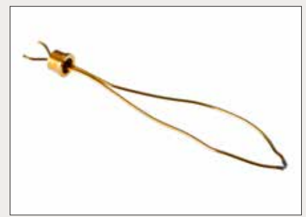
Manufacturing of temperature sensors (Illustration shows gilded platinum sensor)