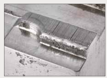
Weld cladding of edges