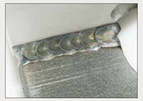
Welded joints of different materials