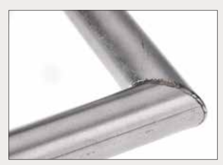
Weld seam for tube corner joint