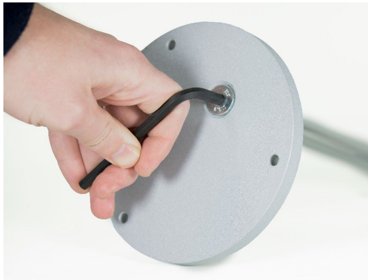
Abb. 5.1 Attaching the stand rod to the base plate