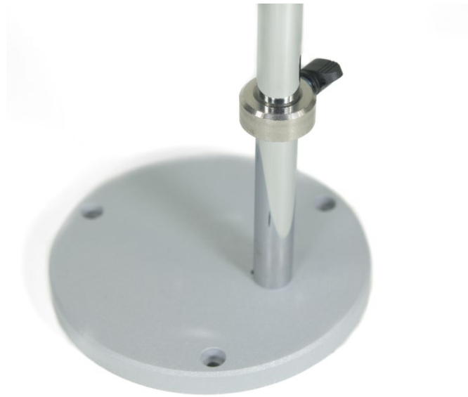
Fig. 5.2 Attaching the adjusting ring to the stand rod