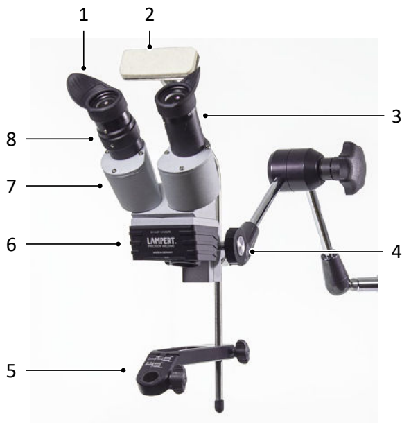
Fig. 3.2 Microscope head