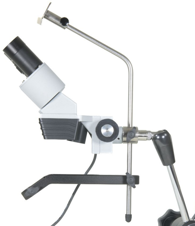
Fig. 5.4 Attach head rest and handpiece holding arm