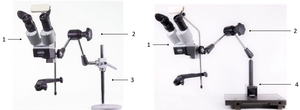
Fig. 3.1 SMG/SMM microscope