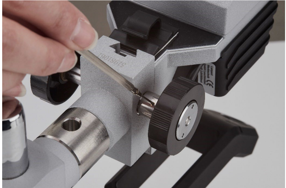
Fig. 7.1 Opening the microscope brake