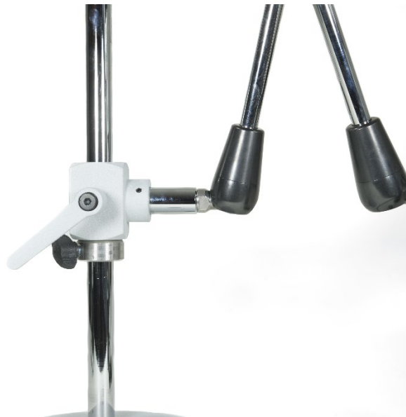
Fig. 5.3 Attaching the articulated arm to the stand rod