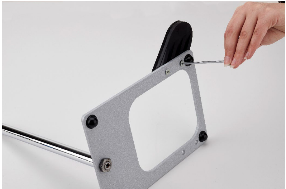
Fig. 5.2 Mounting the hand rests