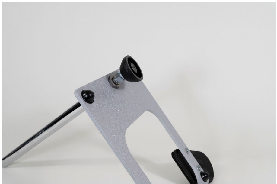
Fig. 5.3 Attaching the tilt adjustment