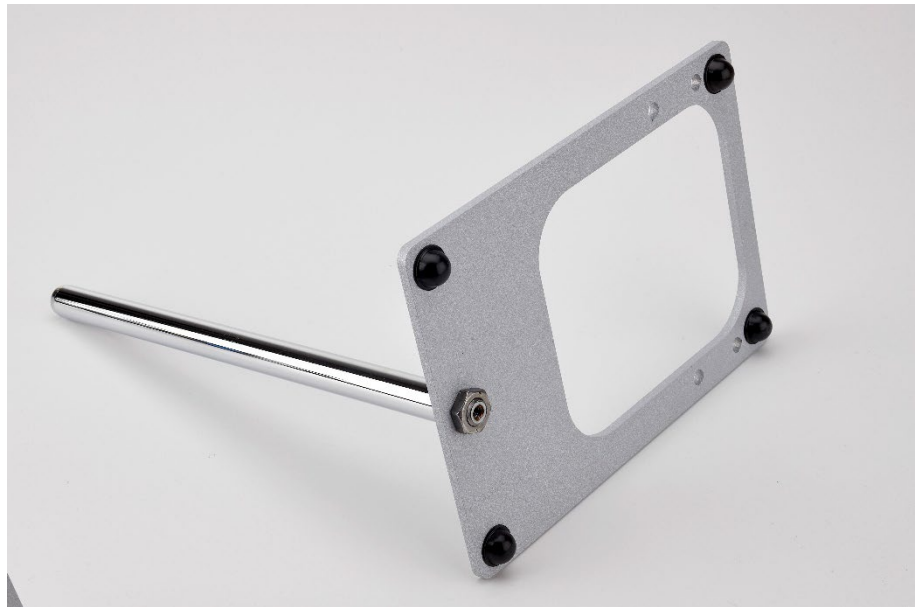
Fig. 5.1 Attaching the rubber feet to the base plate