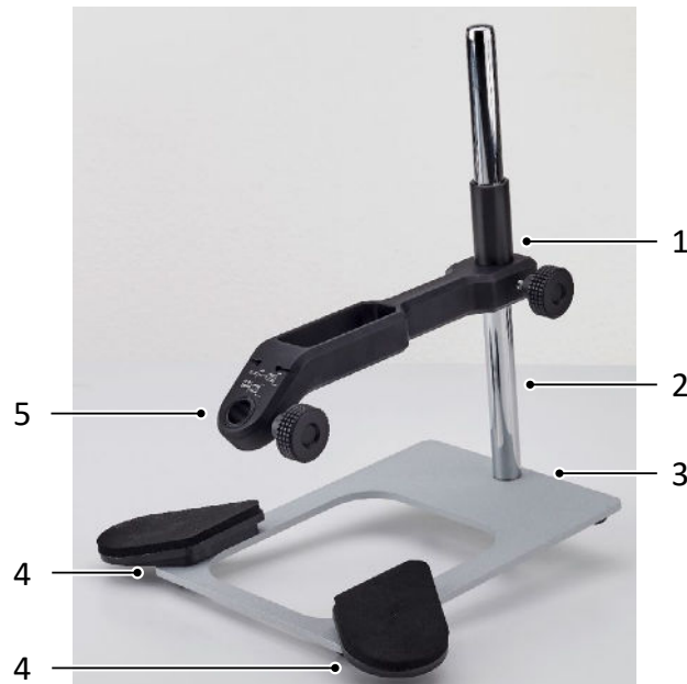
Fig. 3.3 SM 6 stand