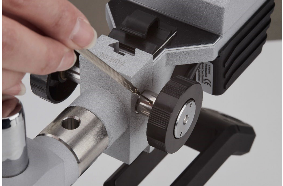
Fig. 7.1 Opening the microscope brake