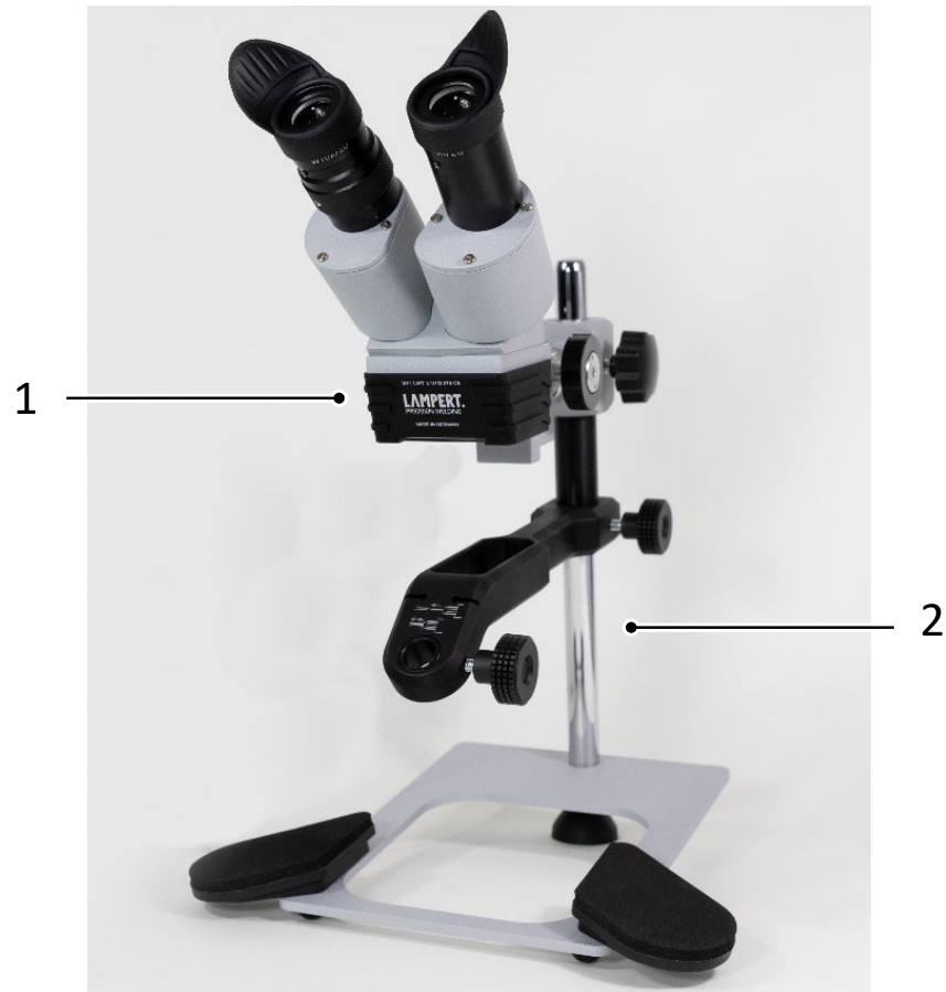
Fig. 3.1 SM 6 microscope