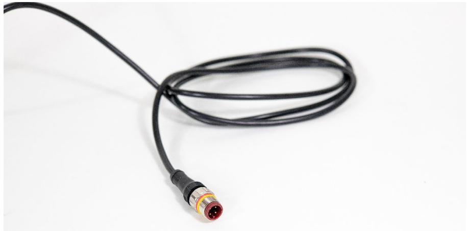
Fig. 5.4 Connection cable with plug

The circular connector for the eye protection system and the LED lighting is inserted in the connecting socket marked in yellow/red on the rear side of the Lampert fine welding device and tightened with the union nut until hand tight.