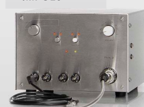
(fig. PUK 2)